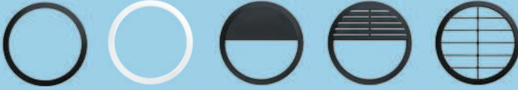
Bezel trim BLK Bezel trim WH Eyelid trim Eyelid grille trim Grille trim